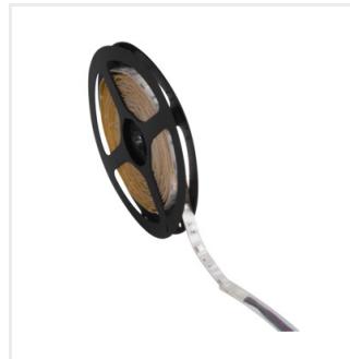
LEDS-B 7.2W/M IP65RGB