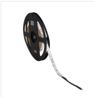
LEDS-B 7.2W/M IP00RGB