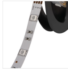
LEDS-B 7.2W/M IP00RGB