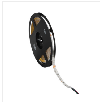
LEDS-B 7.2W/M IP54RGB