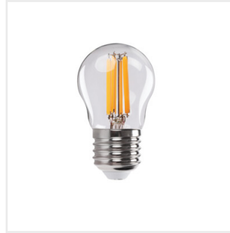
XLEDEX G45E27 3,8W-WW