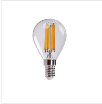
XLEDEX G45E14 3,8W-WW