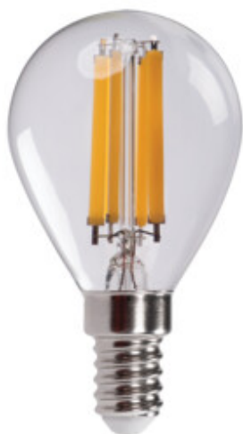
XLEDEX G45E14 3,8W-WW