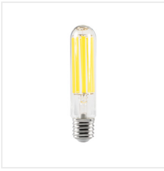
XLED HP EX E40 43W-NW