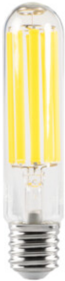
XLED HP EX E40 43W-NW