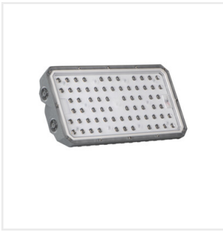
FL STADER 200W 60D NW