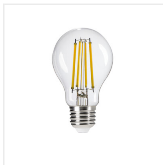
XLEDIM A60 E27 11W-NW